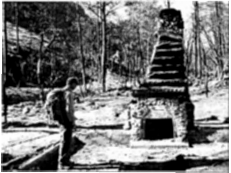
The cabin in Capulin Canyon escaped the 1996 Dome and 2000 Cerro Grande fires and floods. The Las Conchas Fire consumed it entirely despite previous burns nearby that removed considerable tinder. Optimal fire frequency is an important consideration for fire managers.